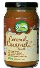
Coconut Caramel Sauce