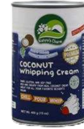
Coconut Whipping Cream