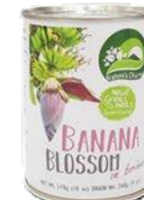
Banana Blossom in Brine