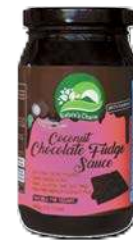
Coconut Chocolate Fudge Sauce