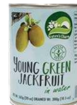
Young Green Jackfruit