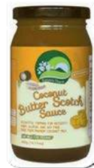
Coconut Butter Scotch Sauce