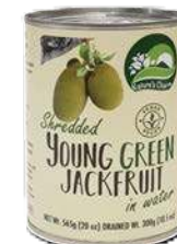
Shredded Young Green-Jackfruit