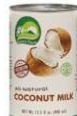
All Natural Coconut Milk