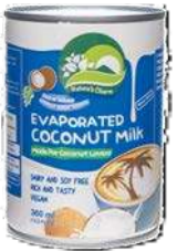
Evaporated Coconut Milk