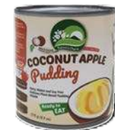
Coconut Apple Pudding