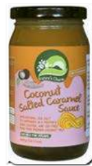
Coconut Salted Caramel Sauce