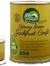
Young Green Jackfruit Confit