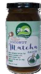
Coconut Matcha Sauce