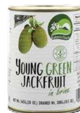
Young Green Jackfruit