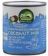
Sweetened Condensed Coconut Milk